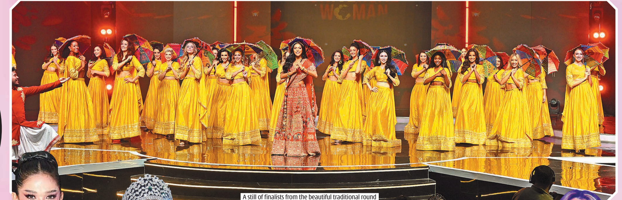
A still of finalists from the beautiful traditional round