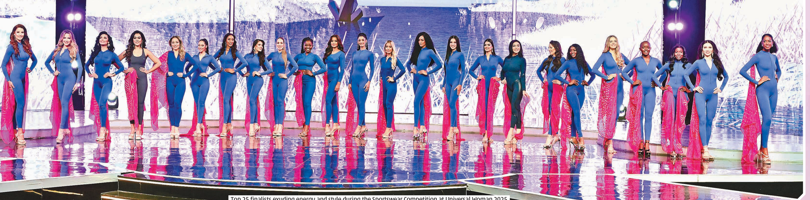
Top 25 finalists exuding energy and style during the Sportswear Competition at Universal woman 2025