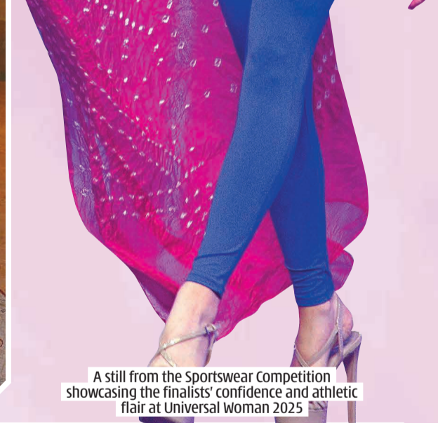
A still from the Sportswear Competition showcasing the finalists' confidence and athletic flair at Universal Woman 2025