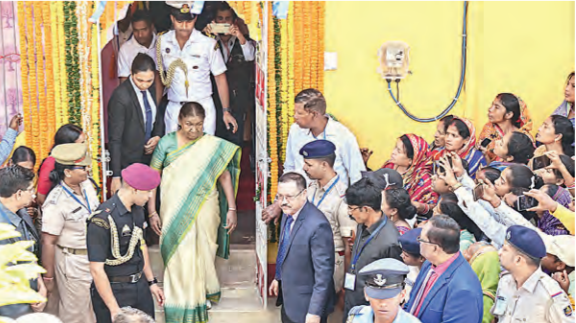
President Droupadi Murmu during a visit to Uparbeda Government Upper Primary School at Uparbeda village in Mayurbhanj district of Odisha on Friday.

President Droupadi Murmu on Friday turned emotional while visiting her birthplace Uparbeda village in Odisha's Mayurbhanj district and said she has never felt the village as a place but a family. Murmu, who was born in a Santali family of Uparbeda village under Bamanghati sub-division on June 20, 1958, for the first time came to