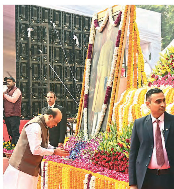
Om Birla pays tributes to Dr BR Ambedkar on his Mahaparirvan Day the Prerna Sthal in Parliament complex, New Delhi on Friday.