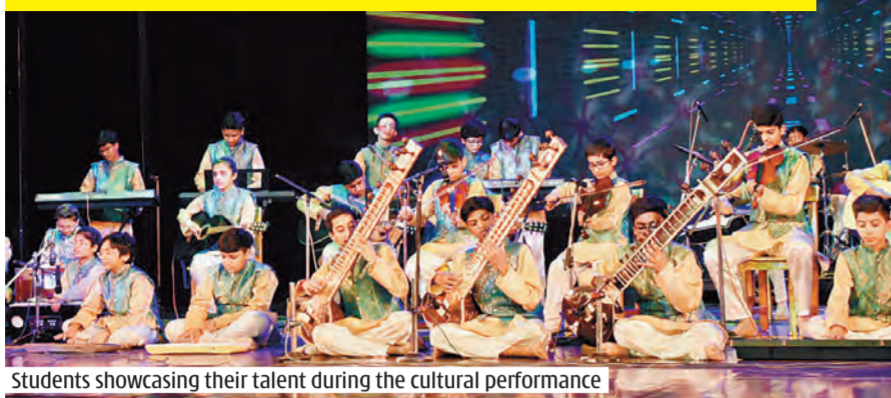
Students showcasing their talent during the cultural performance