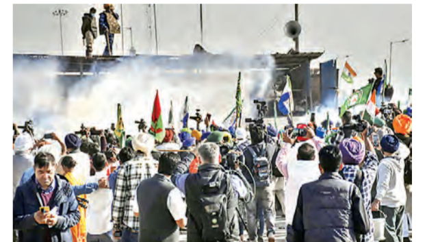
Tear gas being used by security personnel to disperse protesting farmers at Shambhu border in Patiala district, Punjab on Friday.