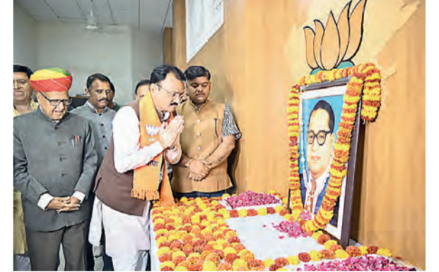
Chief Minister Bhajan Lal Sharma & Deputy Chief Minister Dr Prem Chand Bairwa pay floral tribute to Dr BR Ambedkar on his 69th death anniversary, observed as Mahaparinirvan Diwas, in Jaipur on Friday.