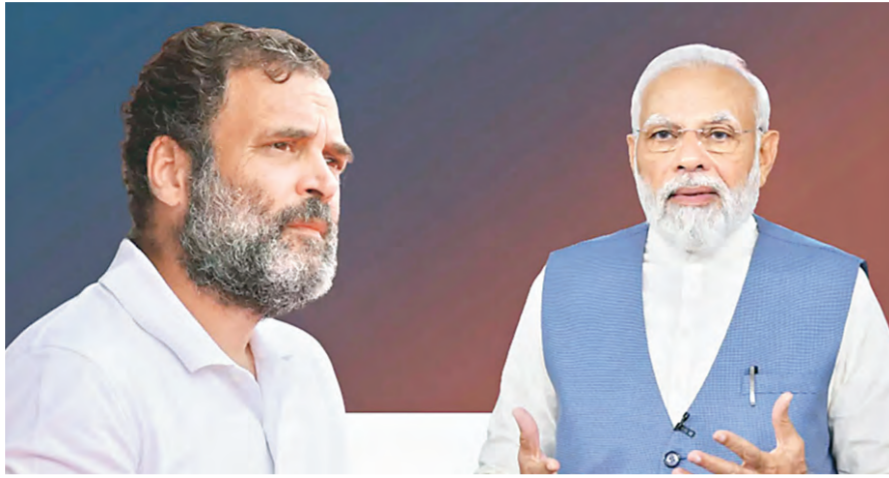
BJP leaders have dismissed the charges against Adani and accused Congress leader Rahul Gandhi and Soros of deliberately targeting Prime Minister Narendra Modi for political gains.

Gandhi's Congress party used the Organized Crime and Corruption Reporting Project (OCCRP)'s articles that "singularly focused" on the Adani Group and its alleged closeness to the government to undermine Modi, the ruling party said on Thursday.