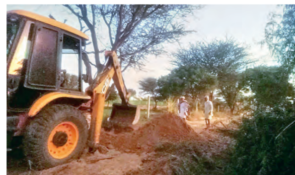
District administration opened 41 paths on Friday through consensus and persuasion.