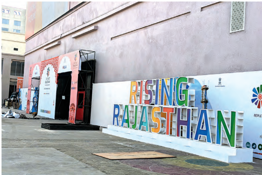
Preparations are going on in full swing at Jaipur Exhibition & Convention Centre (JECC) located at Sitapura in Jaipur ahead of the Rising Rajasthan Summit to be held from December 9-11.

The Rajasthan is set to host the Rising Rajasthan Global Investment Summit 2024 under the leadership of Chief Minister Bhajan Lal Sharma. With over Rs 25 lakh crore in MoUs already signed, the summit aims to boost investments across various sectors.