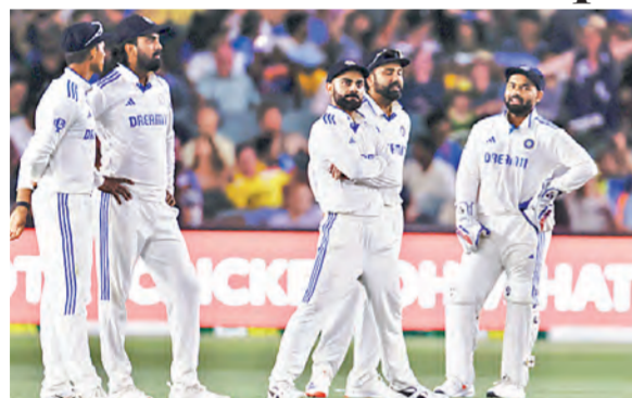
Indian players during the day one of the second cricket test match between Australia and India at the Adelaide Oval, Australia, Friday.