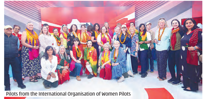
Pilots from the International Organisation of Women Pilots