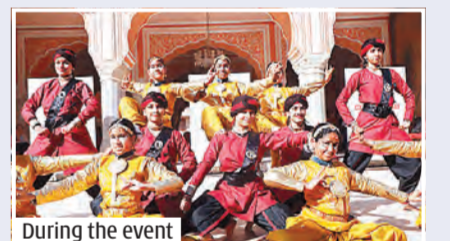
During the event

The third day of the Jaipur History Festival saw 2,600 students from 47 schools across cities like Delhi, Gurugram, Ghaziabad, Varanasi and