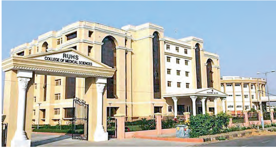
Recruitment at RUHS: 69 assistant professor and 441 non-teaching posts to be filled.

When the RUHS administration started working on implementing the Bhajan Lal government's announcement to establish RIMS on the lines of AIIMS, it was discovered that AIIMS had already