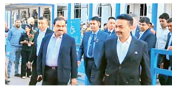
Businessman Gautam Adani at Jodhpur Airport on Friday. From here he went to the Umaid Bhawan Palace.

The event is taking place at the Umaid Bhawan Palace on Dec 6-7.