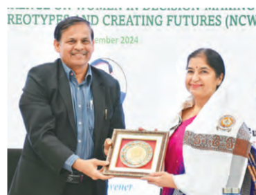
REOYTPREND CREATING FUTURES (NCW) December 2024