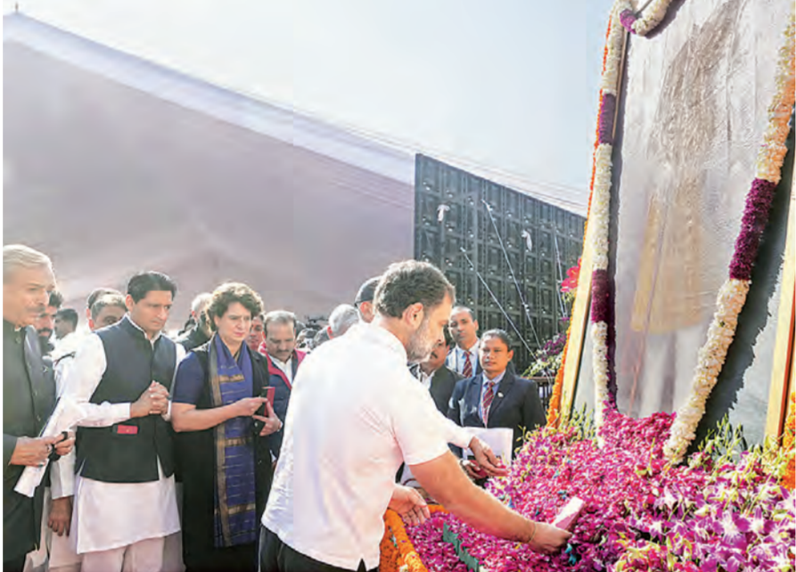
Leader of Opposition in the Lok Sabha Rahul Gandhi places a copy of the Indian Constitution near a photograph of BR Ambedkar at Prema Sthal during a protest march of opposition MPs over Adani issue amid the ongoing Winter session of Parliament on Friday.

Congress members trooped to the House's Well raising slogans against the BJP.