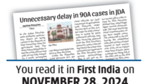
Unnecessary delay in 90A cases in JDA. You read it in First India on NOVEMBER 28, 2024

The revised rules now allow for the disposal of land after the implementation of 90 'A'. This includes cases where the