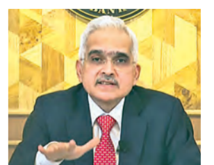
Shaktikanta Das delivers MPC statement in Mumbai, Friday.

The RBI announced its fifth bi-monthly monetary policy of FY25, on Friday. The 6-member Monetary Policy Committee (MPC) led by RBI Governor Shaktikanta Das decided by a 4 to 2 majority to keep the benchmark repo rate unchanged at 6.5% for 11th straight meeting, maintain the monetary policy stance 'Neutral' and to remain unambiguously focused on durable alignment of inflation with the target, while sup-