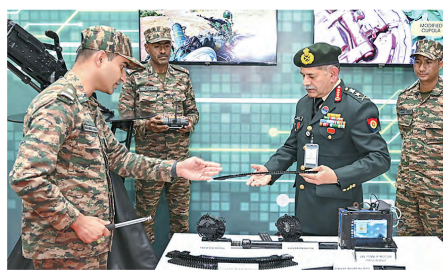
Chief of Army Staff General Upendra Dwivedi during 'Inno-Yoddha 2024-25', an idea and innovation competition cum seminar, at Manekshaw Centre in New Delhi.