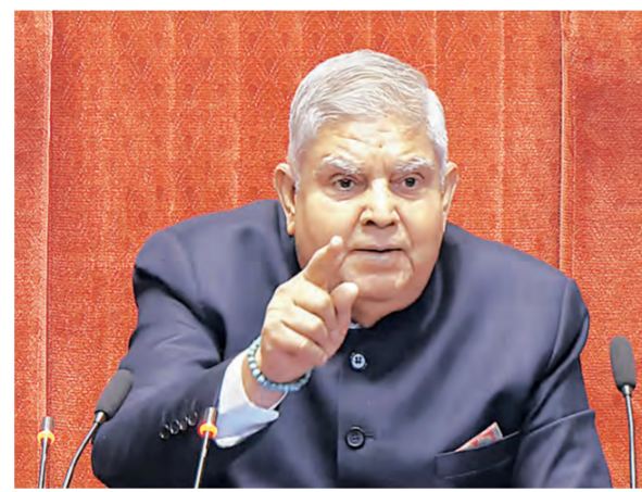
RS Chairman Jagdeep Dhankhar conducts proceedings in the House during the Winter session of Parliament, in New Delhi on Friday.

Chaos erupted in the Rajya Sabha after Chairman Jagdeep Dhankhar announced in the House on Friday that a wad of currency notes was "recovered from seat 222, presently allotted to Abhishek Manu Singhvi," at the closing of Rajya Sabha on Thursday. According to the VP, Dhankhar, what appeared to be a wad of ₹500 notes was found during the routine "anti-sabotage"