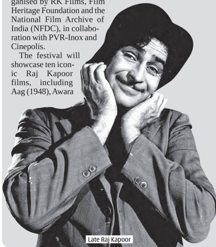
Late Raj Kapoor

The festival promises a nostalgic journey, celebrating the visionary who immortalized Indian cinema on the global stage.