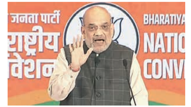
Amit Shah speaks at BJP's National Convention in New Delhi.

Shah described PM Modi as a candle which removes darkness while burning itself, as he lauded the PM's dedication, hardwork and commitment to the country's progress