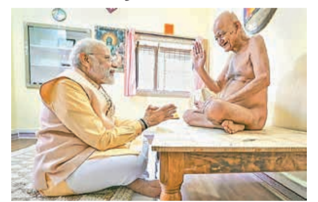
PM Narendra Modi with Acharya Vidyasagar Maharaj.

Renowned Jain seer Acharya Vidyasagar Maharaj breathed his last on Sunday at Chandragiri Teerth in Dongargarh in Chhattisgarh's Rajnandgaon after undertaking 'sallekhna'. Sallekhna is a Jain religious practice involving voluntary fasting unto death for spiritual purification, a statement from the teerth said. Acharya Vidyasagar attained Samadhi through 'Sallekhna' at Chandragiri teerth at 2:35 am, the statement said.