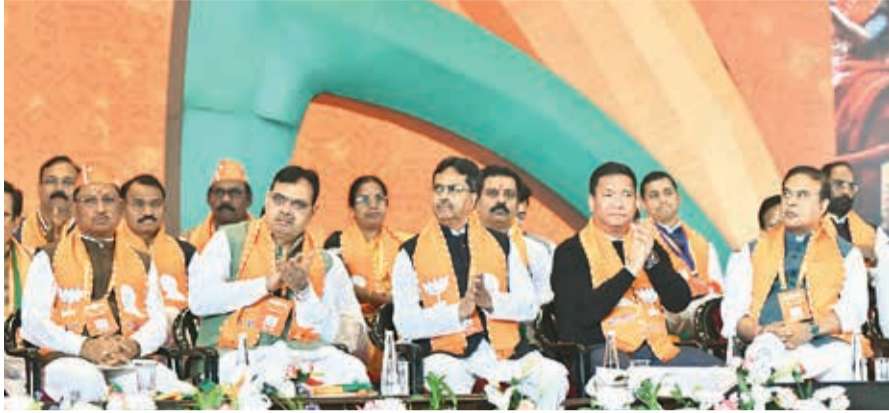
CM Bhajan Lal Sharma and Dy CM PC Bairwa along with Himanta Biswa Sarma and BJP leaders from other States during the BJP national convention in New Delhi on Sunday.

The party has given instructions to its workers to build a rapport with families of beneficiaries. According to a rough estimate, BJP's target is to reach 40 to 50 crore voters from eight crore families. The responsibility of this scheme to help reach the