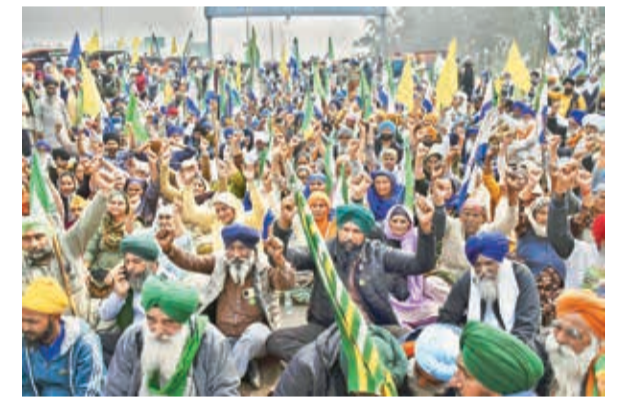
Farmers at the Punjab-Haryana Shambhu border during their 'Delhi Chal' protest, near Patiala district, on Sunday.

The Union ministers and farmer leaders had met earlier on February 8, 12 and 15 but the talks remained inconclusive.