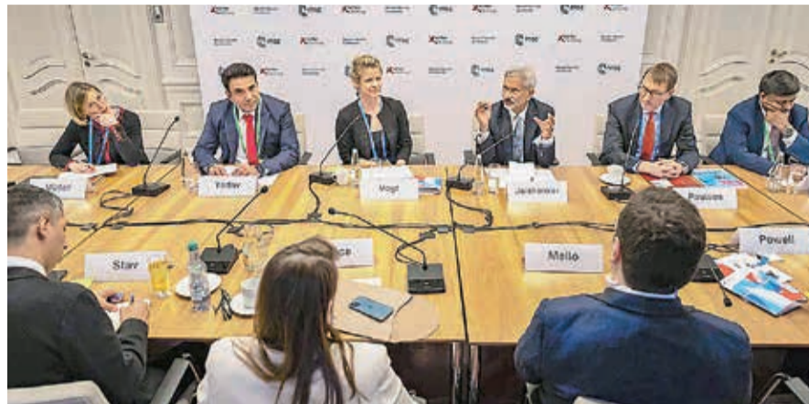
Union External Affairs Minister S Jaishankar during a meeting with the Munich Young Leaders for 2024 on the sidelines of the Munich Security Conference (MSC) 2024.

Jaishankar underlined that an increasing number of countries are now not only supporting the two-state solution to the Palestine issue but seeing it as more urgent than before.