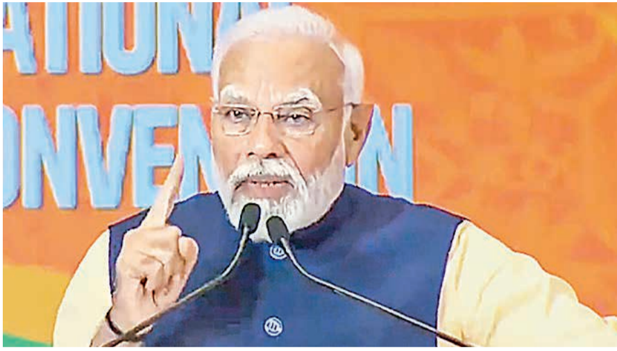
PM Narendra Modi addresses the BJP National Council Convention on its second day at the Bharat Mandapam, in New Delhi on Sunday.

Expanding on the work done by the Centre for the welfare of the poor, women, youth, and farmers, PM Modi said, "Today, the BJP is deriving strength from our women, farmers and the aspirational youth to build a 'Viksit Bharat' (developed India). We introduced a 'PM Vishwakarma Yojana' for them. No one thought about people living on streets and footpaths. We made the PM Swanidhi Yojana for them. Previous governments did not pay attention to the problems of women but we came out with an initiative like 'Beti Bachao-beti Padhao' that had a meaning-