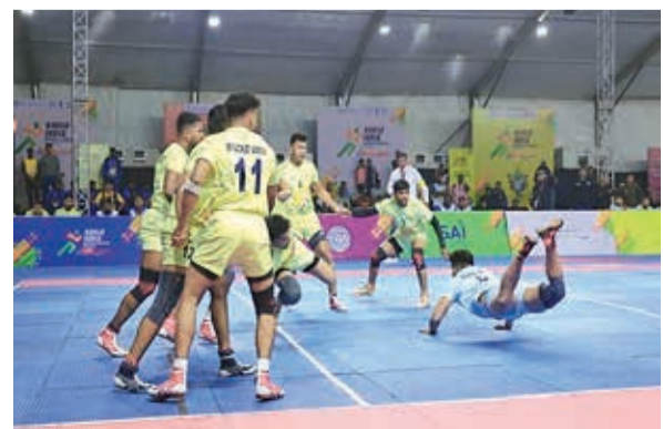
Kabaddi players in action during KIUG.

The games began on Saturday with kabaddi matches at Guwahati's Sarusajai Stadium, they said. Besides, basketball, mallakhamb and women's football matches are being held in different venues in Guwahati on Sunday, while yogasana