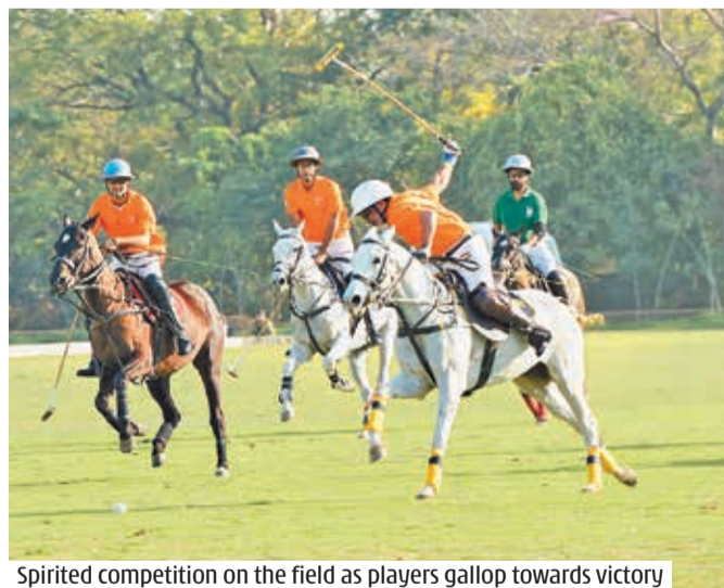
Spirited competition on the field as players gallop towards victory