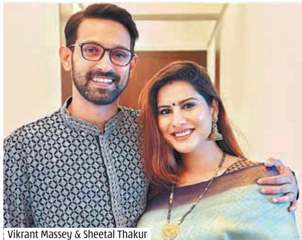
Vikrant Massey & Sheetal Thakur

opened up about his decision to leave behind a lucrative acting job in television, where he was earning Rs 35 lakh per month, to embark on a career in cinema. Vikrant affirmed that he had earned a substantial sum through his television work, noting that he even purchased his first house by the age of 24. Nevertheless, he revealed his departure from a Rs 35 lakh per month contract during his tenure in television. Despite achieving financial stability, Vikrant came to a profound realization: that monetary wealth alone couldn't guarantee a