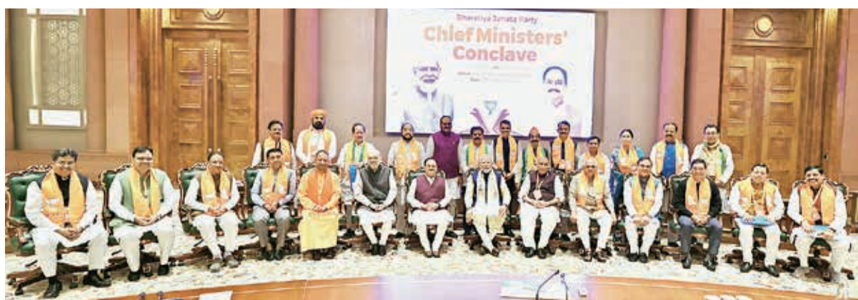
PM Narendra Modi, JP Nadda, Amit Shah, Rajnath Singh, CM Bhajan Lal Sharma (second left), Dy CMs Diya Kumari (standing, 3rd from right) & Prem Chand Bairwa (5th from right) along with CMs and Dy CMs of other BJP ruled states in New Delhi, on Sunday.

State in-charge Arun Singh, state president CP Joshi, ministers Gajendra Singh Shekhawat, Kailash Choudhary, former Leader of Opposition Rajendra Rathore were present.