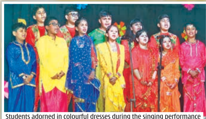
Students adorned in colourful dresses during the singing performance