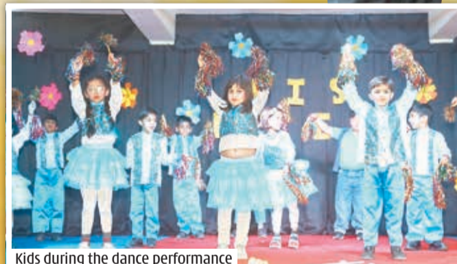
Kids during the dance performance