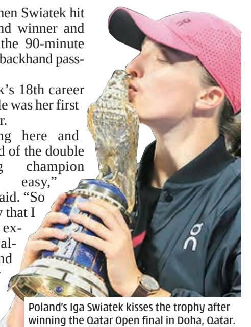
Poland's Iga Swiatek kisses the trophy after winning the Qatar Open final in Doha, Qatar.

Swiatek's 18th career singles title was her first of the year. "Coming here and being kind of the double defending champion wasn't easy," Swiatek said. "So I'm happy that I have this experience already, and hopefully I'm going to use it."