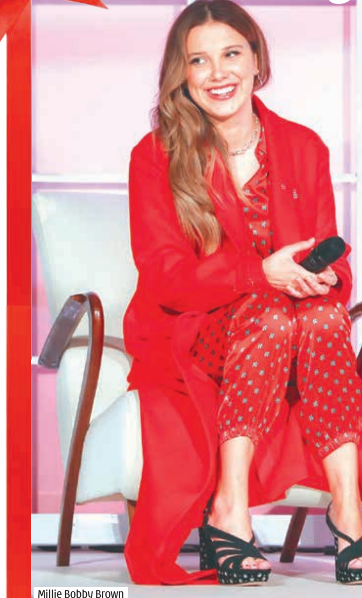
Millie Bobby Brown

M illie Bobby Brown has risen as a shining star in her generation, captivating audiences since her debut as Eleven in Stranger Things . With millions of fans worldwide, she's admired not just for her acting skills, but for her inspiring journey in life. From establishing herself as a businesswoman to debuting as a model and getting engaged to Jake Bongiovi at just 19, she's a true winner. With roles in Enola Holmes , Godzilla Vs Kong , and Godzilla: King of the Monsters , she's proven her versatility. Now, she's gearing up for her upcoming movie Damsel , where she portrays an inspiring princess. And, it's also time to celebrate Millie's 20th this February 19, 2024! For her part as Eleven in the Netflix series Stranger Things , Millie Bobby Brown is most known. At the age of 10, she made her acting debut.