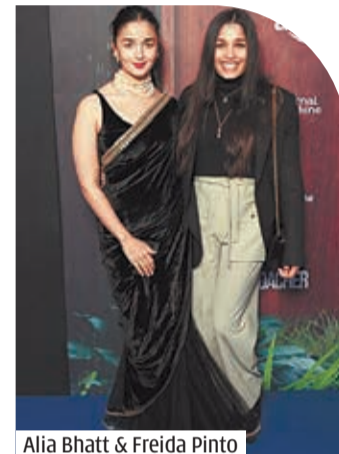
Alia Bhatt & Freida Pinto

T he eagerly awaited series, Poacher , backed by Alia Bhatt, is poised for its upcoming premiere. A recent special screening of the show took place in London, with Alia adorning the occasion in a captivating black saree, exuding a dream-like aura. Joining the event, actress Freida Pinto also showcased her style in an elegant black ensemble. The delightful sight of Alia and Freida exchanging warm greetings and posing together for pictures added to the glamour of the event. On Saturday, a screening of the upcoming series Poacher took place in London, drawing numerous celebrities associated with the project, including creator Richie Mehta and executive producer Alia Bhatt. Among the distinguished guests was actress Freida Pinto. A heartwarming moment unfolded between Alia and Freida, where they warmly