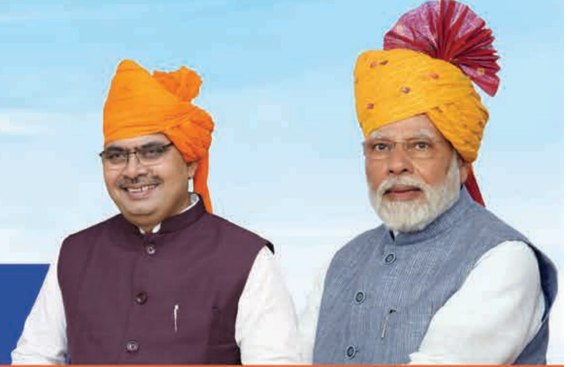
श्री भजनलाल शर्मा माननीय मुख्यमंत्री, राजस्थान