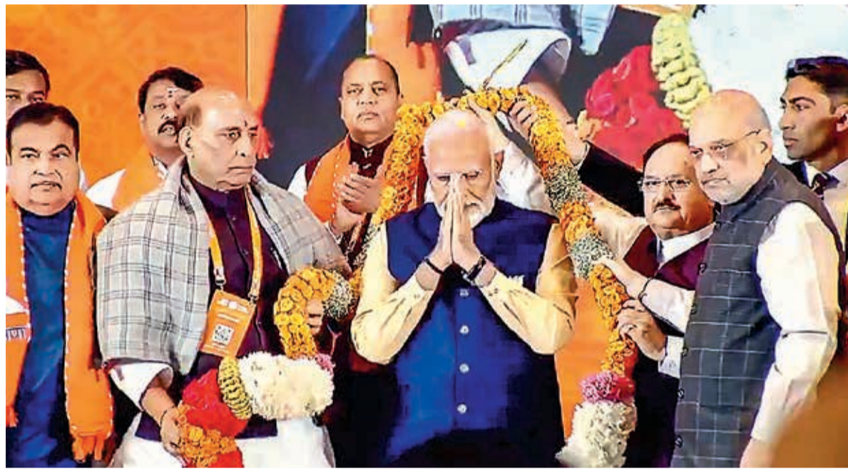
PM Narendra Modi being garlanded by Union Home Minister Amit Shah, Defence Minister Rajnath Singh, BJP National President JP Nadda and others on the second day of the BJP National Council Meeting, at the Bharat Mandapam, in New Delhi, on Sunday.

Dreams of cores of women, poor and youths are Modi's dream, he said. More on P6