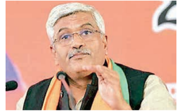
Union Jal Shakti Minister Gajendra Singh Shekhawat