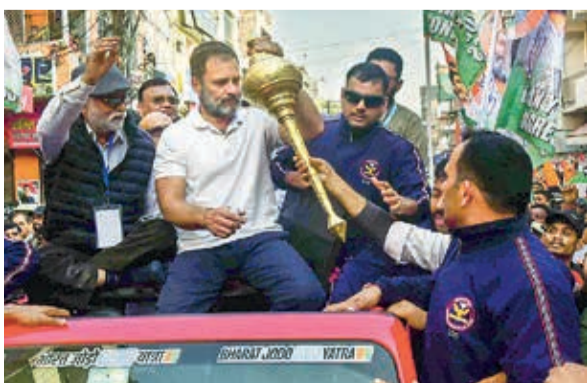
Congress leader Rahul Gandhi receives a 'Gada' at a roadshow during the 'Bharat Jodo Nyay Yatra' in Prayagraj on Sunday.

"Where more than 1.5 lakh government posts