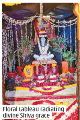
Floral tableau radiating divine Shiva grace