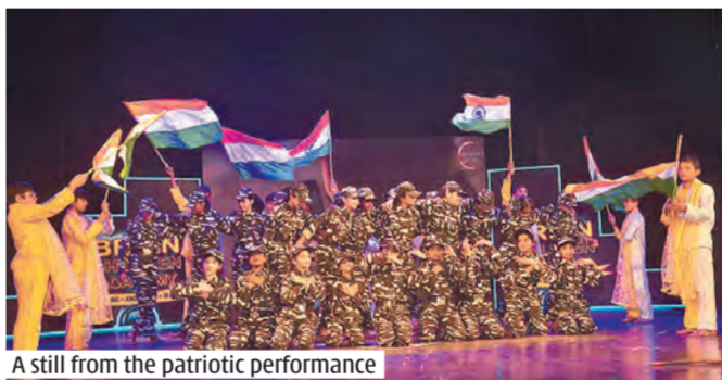
A still from the patriotic performance