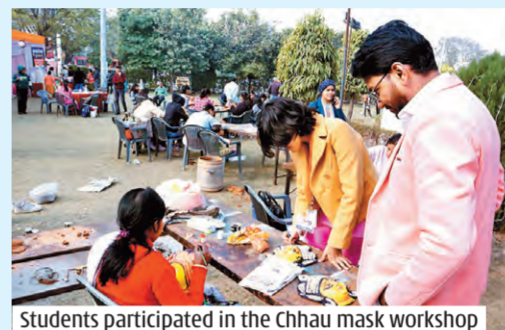
Students participated in the Chhau mask workshop