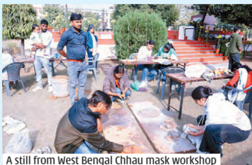
A still from West Bengal Chhau mask workshop