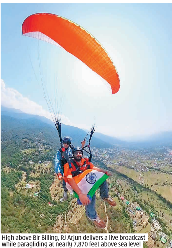
High above Bir Billing, RJ Arjun delivers a live broadcast while paragliding at nearly 7,870 feet above sea level