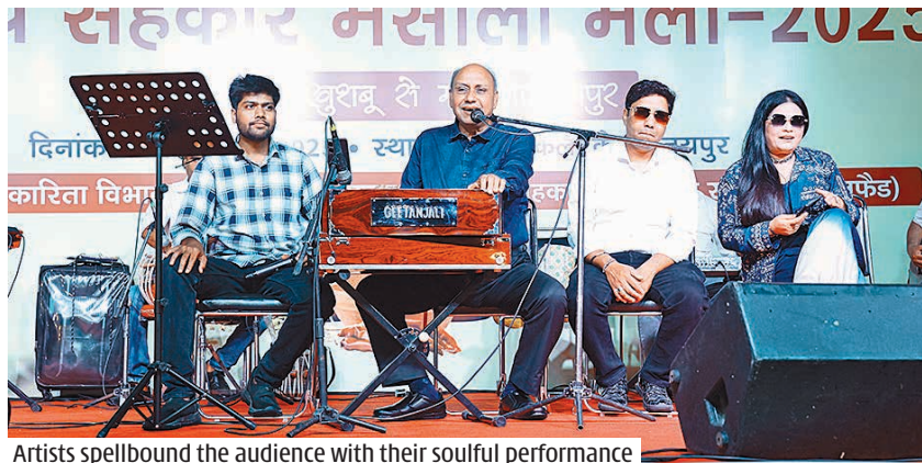
Artists spellbound the audience with their soulful performance

A major highlight of the day was the captivat-