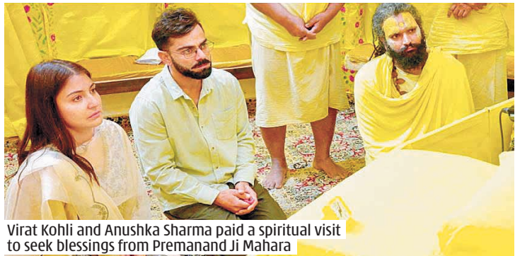
Virat Kohli and Anushka Sharma paid a spiritual visit to seek blessings from Premanand Ji Maharaj

Percentage: 96.4% School: Maheshwari Public School, Jaipur