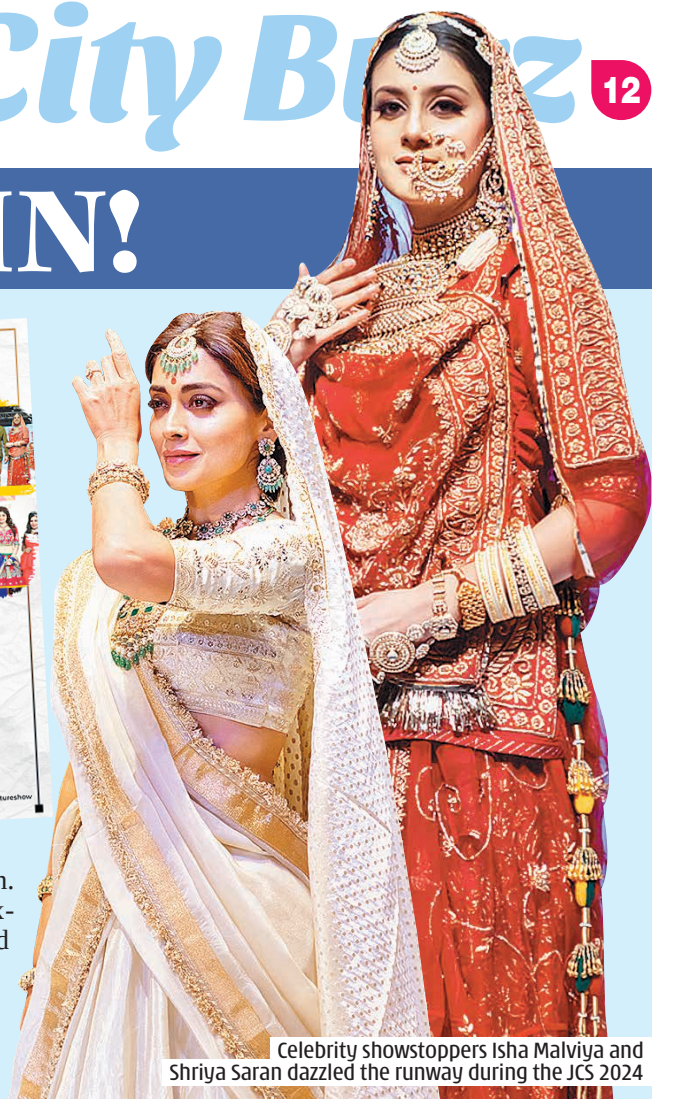
Celebrity showstoppers Isha Malviya and Shriya Saran dazzled the runway during the JCS 2024

Anil Bhattar, and Ankur Jain. This three-day fashion extravaganza will be streamed live on First India Plus OTT platform and YouTube, with coverage from over 100 websites.