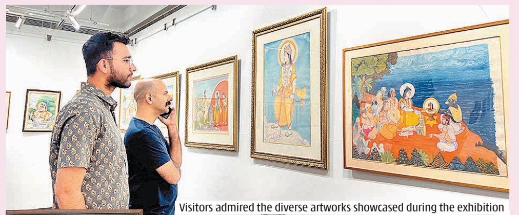
Visitors admired the diverse artworks showcased during the exhibition