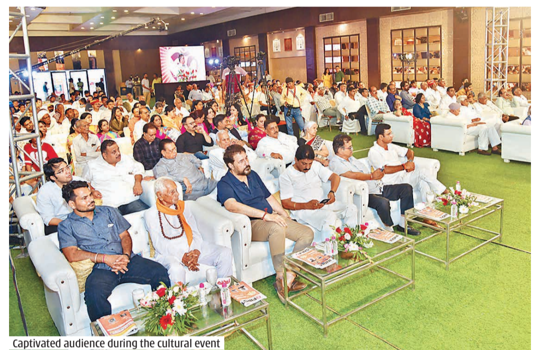
Captivated audience during the cultural event