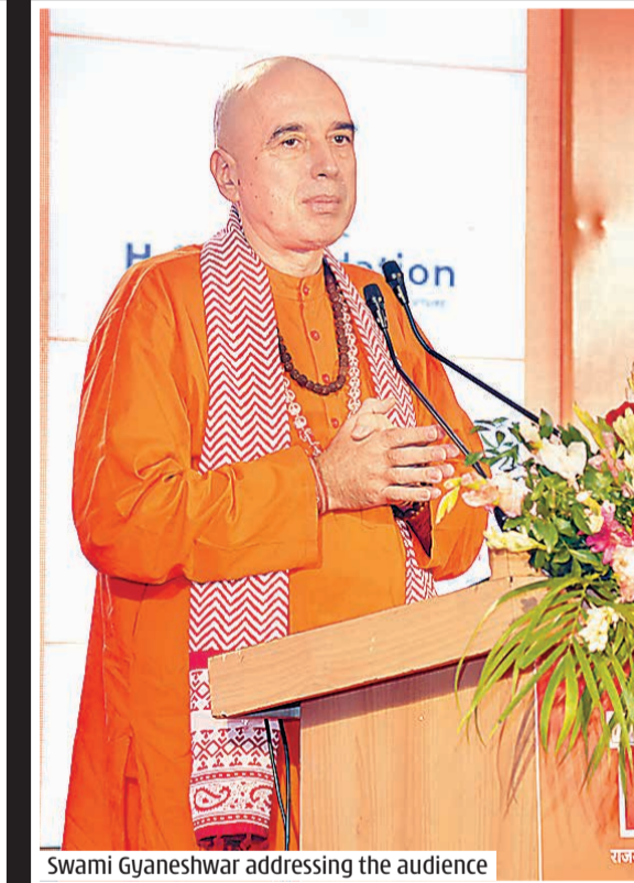
Swami Gyaneswar addressing the audience