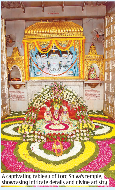
A captivating tableau of Lord Shiva's temple, showcasing intricate details and divine artistry